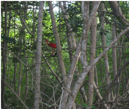
Eudocimus ruber Scalet Ibis at the Caroni Swamp, Trinidad and Tobago